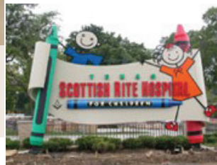
Scottish Rite operates 17 Hospitals and 38 Clinics in central Texas.